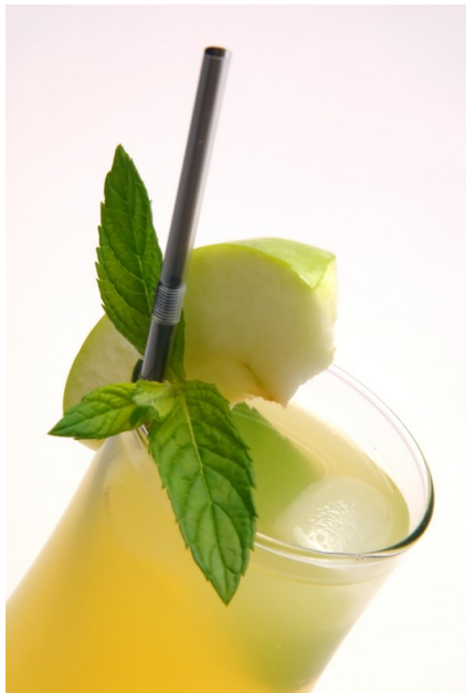
Healing foods for the mind body & spirit